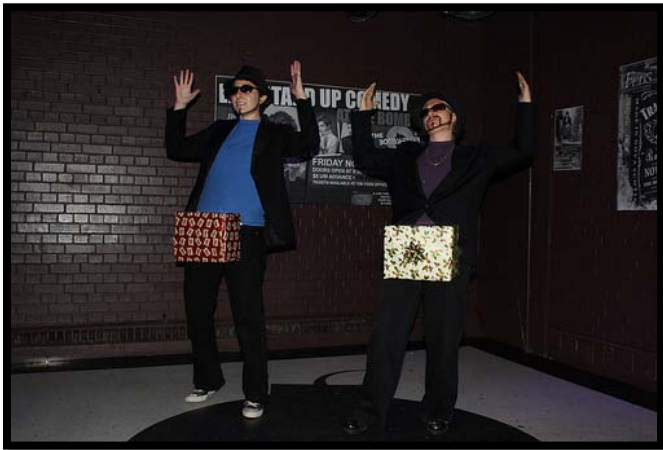
Two of our fabulous drag kings at Drag Me to the Bomber