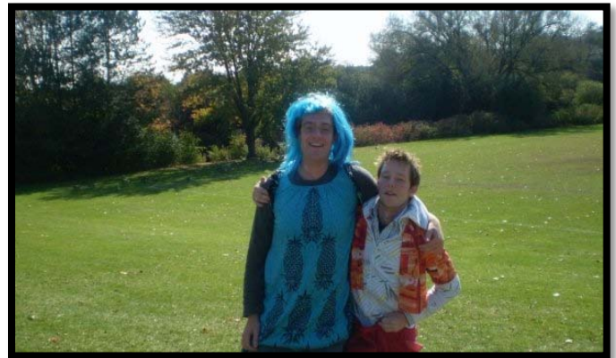
Two contestants participating in the 3-legged Drag Race, one of the five parts of the Gaymazing Race

A raising of the pride flag, a queer careers speaker and reception event, and overnight flag guard (which included a showing of "Mean Girls") were all a part of this amazing week to celebrate the courage showcased by the queer community when facing coming out issues. To top things off, the week ended with our first ever Gaymazing Race!