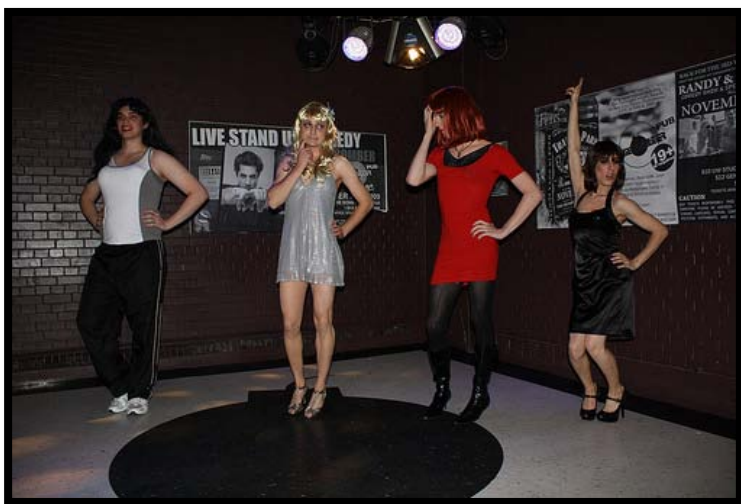
Four of our lovely drag queens impersonating the Spice Girls at Drag Me to the Bomber!